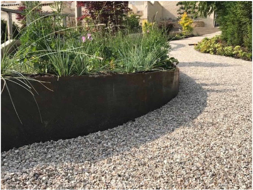
Proposed Planted bed edging: Legacy Edging Legacy 6 structural Steel edging

Planted bed with raised edging spec: Legacy Edging Legacy 6 200mm in galvanized steel or suitable equivalent. Planter with raised edge to act as deterrent to vehicle movement and remove need for bollards. Planted bed to be robust perennial mix of low maintenance planting